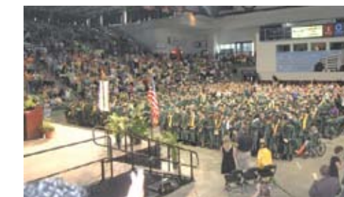
High school graduation ceremonies are held at the USC-Aiken Convocation Center. Local businesses and community leaders donate funds to make this possible.