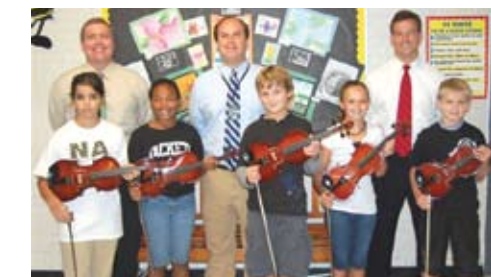
Public Education Partners was named the Champion of Education for 2009. An independent, community managed educational foundation, PEP support has provided funding for numerous projects, including Synergistic labs, string music programs, and teacher grants through the years.

With higher education colleagues, business leaders, law enforcement, community leaders, and parents working cooperatively, our goal to provide an excellent education with appropriate resources and funding mechanisms for all Aiken County students will be attained.