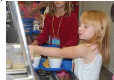
Over 3,964,806 meals (breakfast and lunch) were served in our cafeterias last year.

Average Teacher Salary: $48,691 First Year Teacher Salary is the Highest in South Carolina: $35,729 59% of our teachers have a Masters Degree or higher. 3,150 Employees: Second largest employer in Aiken County 11 National Board Certified Teachers named in 2009